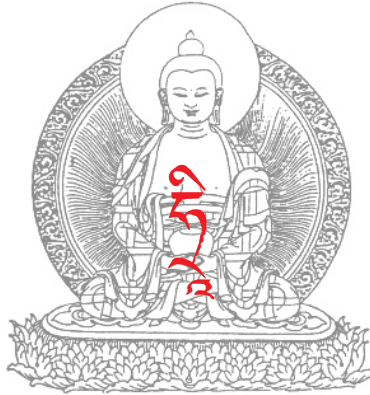
Hundred Syllable Mantra

In response to this, from the heart of the Amitabha on my crown rays of light shine forth, drawing in the attainments of long life. Inside the long-life vase in Amitabha's hands is the syllable HRIH. All the attainments of long life dissolve into the HRIH. From the HRIH nectar flows, continuously filling my body. By this activity, I achieve the attainment of immortality.